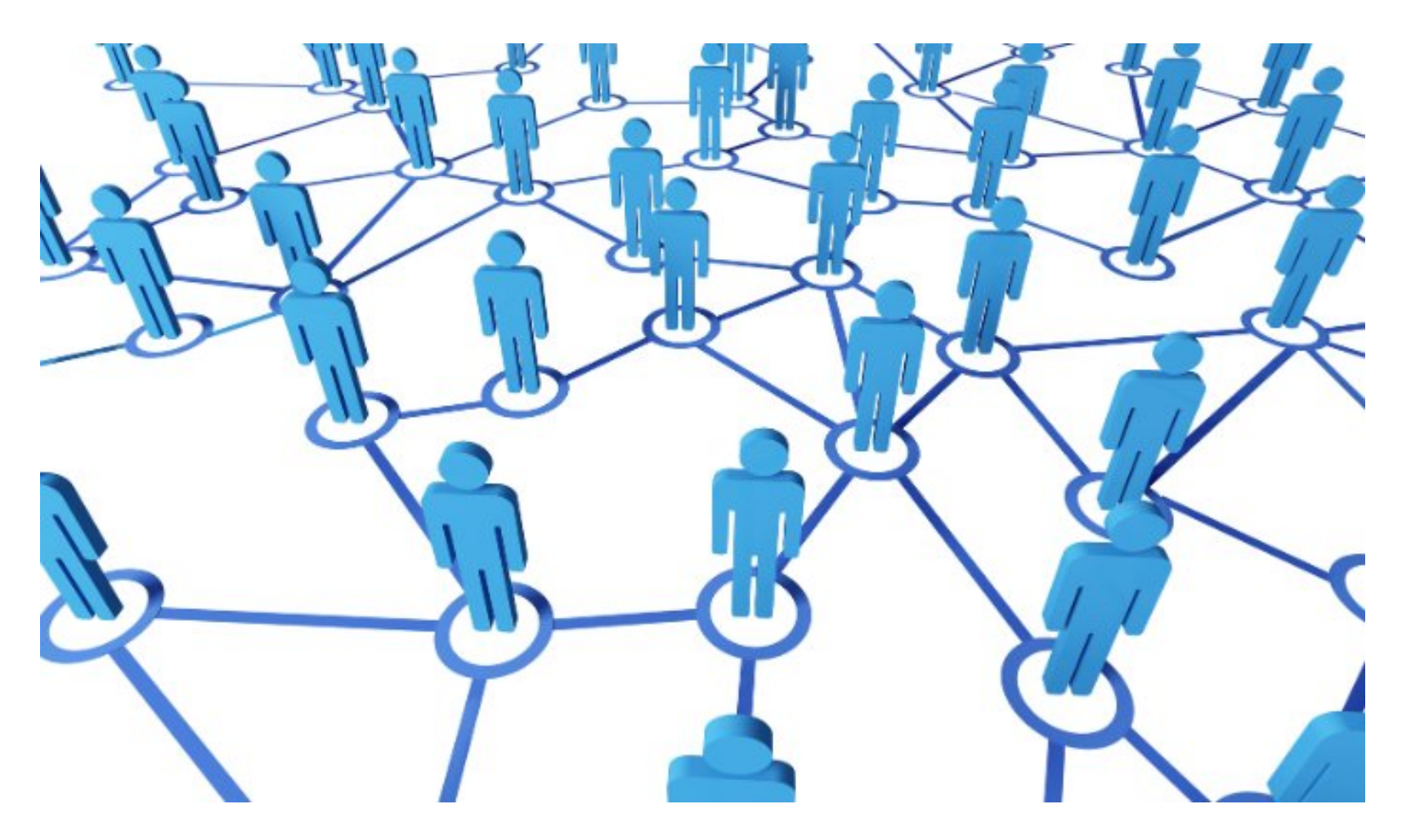
Connecting People Plan 2017/18 - Q3 update